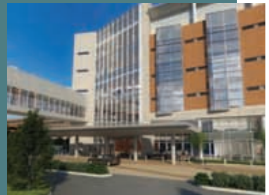
Artist’s rendering of the state-of-the-art facility built for heart care.

With the excellence of our medical team, superior outcomes achieved year after year, the quality of our patient care, and a new building that centrally houses this expertise, Lankenau is the destination of choice for heart care in the region.